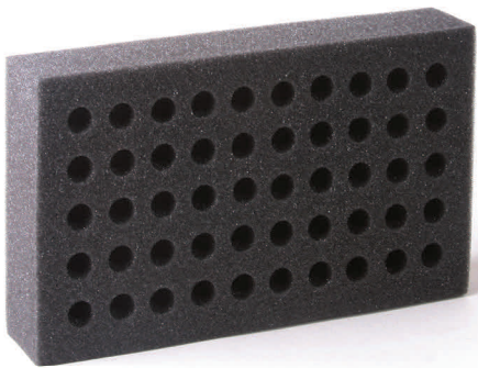
Fits 50 Tubes, sizes: 15 x 85mm, 16 x 100mm, 16 x 125mm, 16 x 150mm, 0011